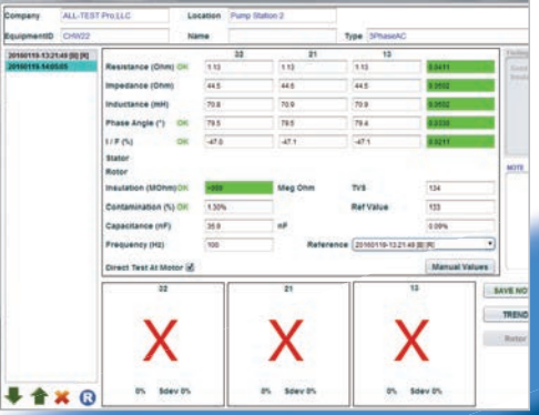
Three-Phase Motor Analysis