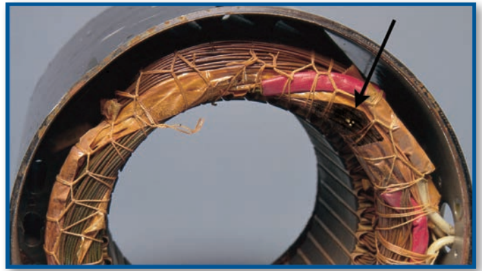
This winding fault was caused by a voltage surge. An insulation test will not detect it!

ALL-TEST PRO® is your best choice for fault detection and troubleshooting.